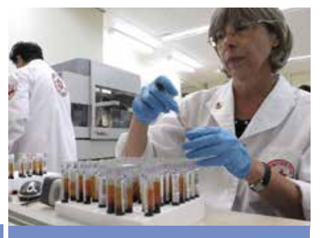
Cross checking details on blood vials