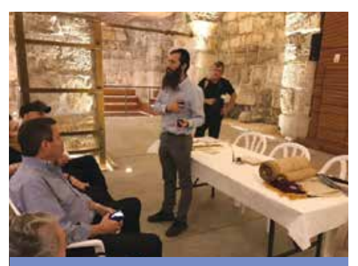
A fascinating visit to the Kotel tunnels