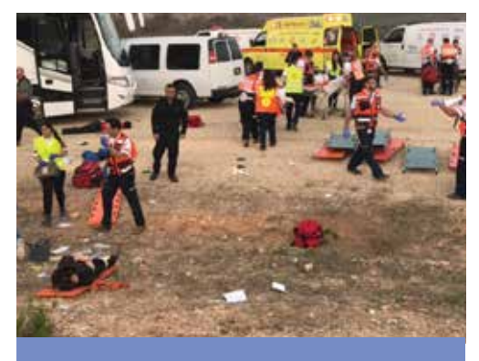
Mass Casualty Incident (MCI simulation)

Dramatic helicopter rescue as part of MCI