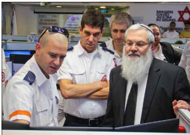
Deputy Minister of Defense, Rabbi Eli Ben Dahan (Habait Hayehudi), visited the Magen David Adom National Command and Control Centre in November.