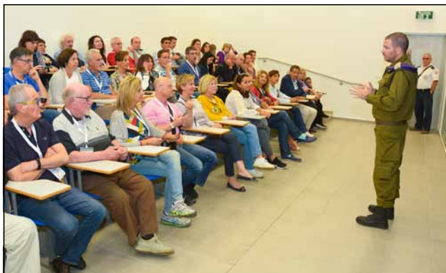
IDF Medical Training Corps at the Ariel Sharon Base.