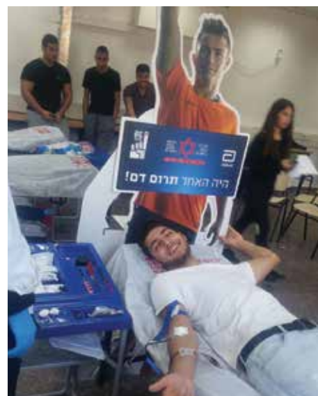
Lifesize image of Cristiano Ronaldo is on display in blood collection centres

Prof Eilat Shinar, Director MDA Blood Services stressed, "MDA requires about one thousand units per day for its blood services. Blood donation is voluntary but there are times when it is more difficult to find donors. If the sick and injured, civilian or military are to receive the best treatment possible in times of routine or emergency, it is vital that the public joins in saving lives by attending MDA blood donation locations around the country to give blood all year round."