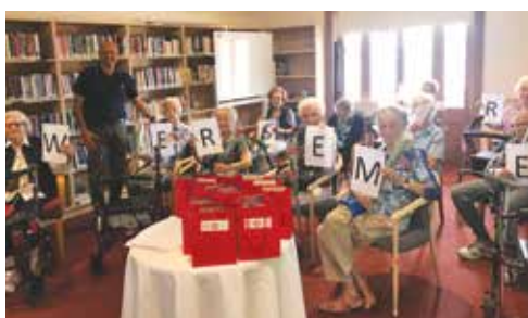
Woollahra Montefiore Home residents hold up We Remember

We are always available to provide your organisation with an Israel Update, so please contact the office on 9358 2521 to arrange a time.