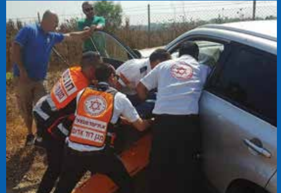
MDA paramedics can respond more quickly to accidents thanks to eCall technology

eCall is just another way Magen David Adom is using technology to get to the sick and injured more quickly, to begin treatment sooner, and ultimately save more lives.