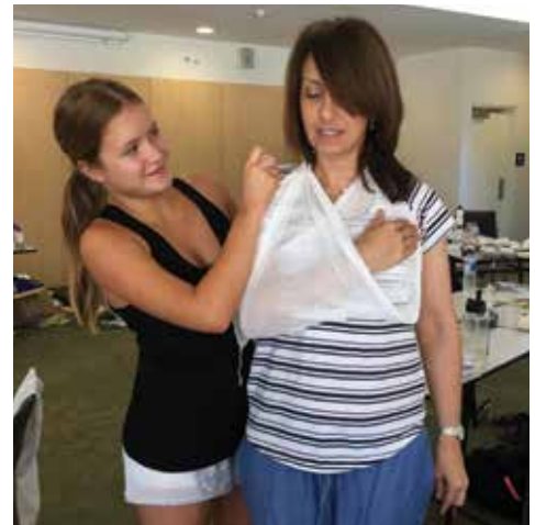
First aid training contributes to the safety of our local community

There will even be free courses offered to parents and grandparents on Caring for Kids. These will include first aid, emergency response plans for babies and children, pool safety and helpful hints. Even a little knowledge could make all the difference.