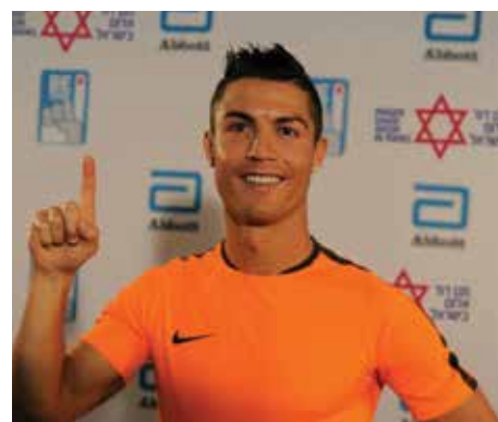
Ronaldo calls on the public to BeThe1