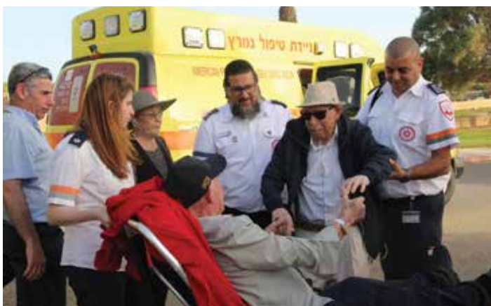
Emotional meeting as the brothers embrace for the first time in two years