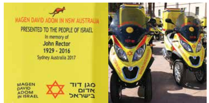
The inscription displayed on both medicycles