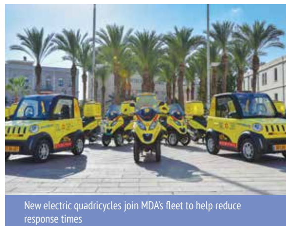
New electric quadricycles join MDA's fleet to help reduce response times