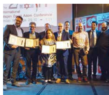
Presentations to Australian delegates at closing Gala Dinner