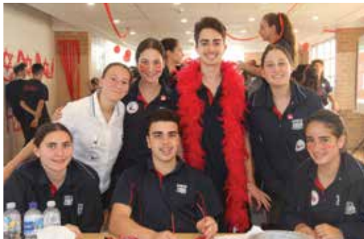
Some of the Hillel House students who took part in the Challenge

On Wednesday 8th November years 7 - 11 students from Hillel House, Moriah College hosted a charity quadrathlon event, strengthening their wonderful relationship with Magen David Adom.