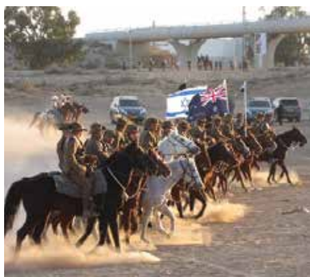
Exciting re-enactment of the Charge of the Light Horse in Beersheva